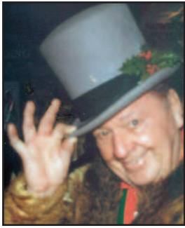
Herschel Green Photo