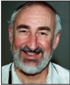
Joan Golding Photo