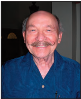
Joan Golding Photo