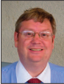
Joan Golding Photo